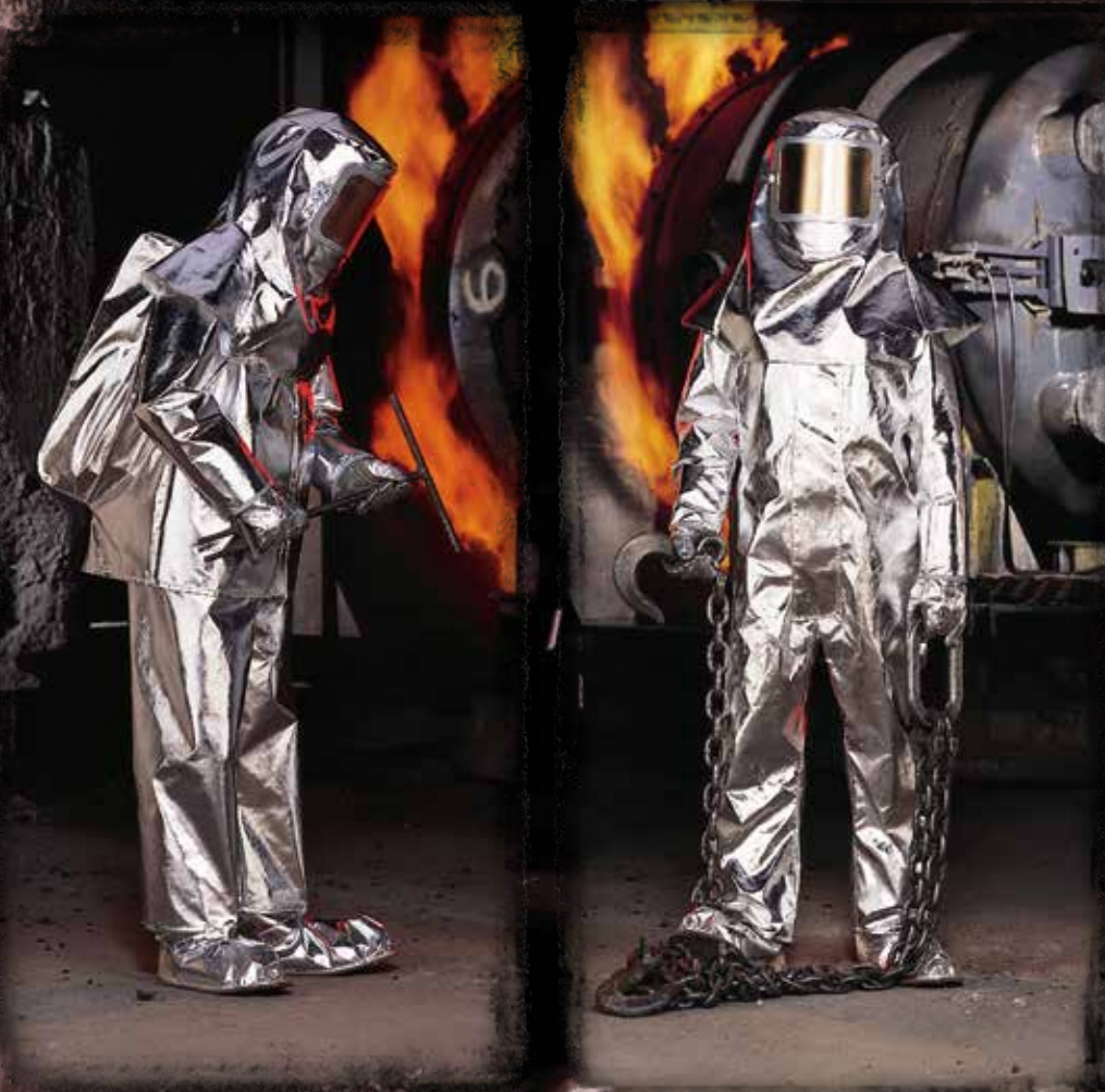
Left, the 300 Series Approach Suit, featuring a coat and pants. Right the 305 Series Approach Coverall.

These heat reflective 300 and 305 Series Approach Suits are designed for personnel engaged in maintenance, repair and operational tasks in areas of low ambient, high radiant heat, much the same as our 500/505 Series. However, the 300 and 305 Series Approach Suits have no moisture/steam barrier, making these garments suitable for situations where exposure to hot liquids, steam or hot vapor is not a possibility.